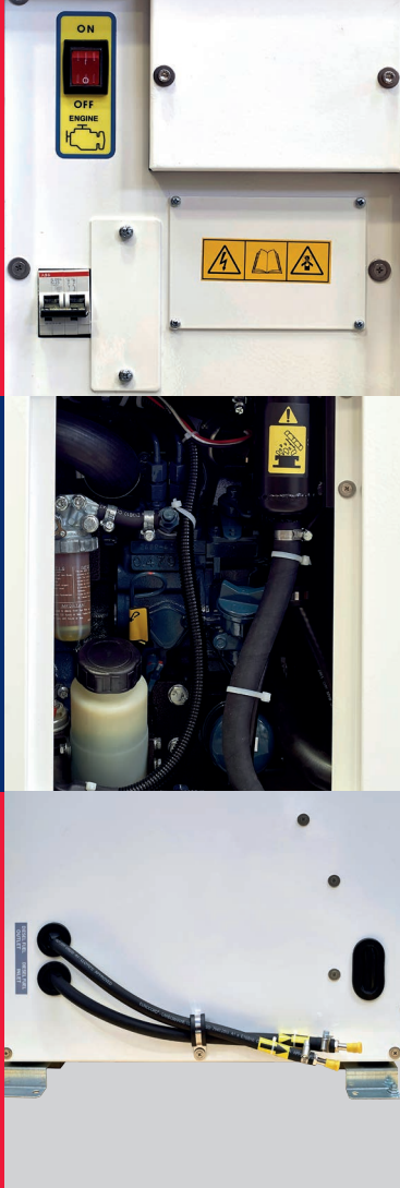
Fuel inlet and outlet