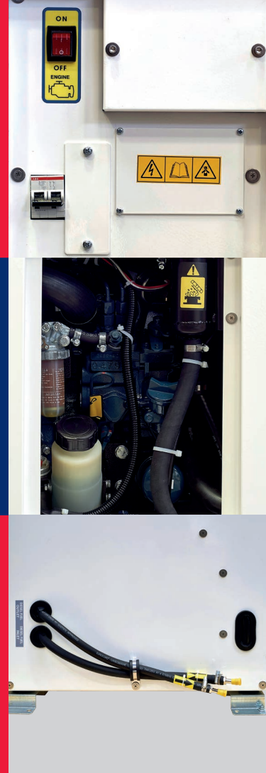
Fuel inlet and outlet