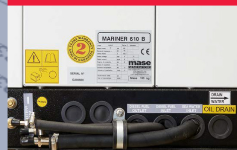
INPUT/OUTPUT FUEL PIPE

the engine is cooled by a coolant loop in a closed circuit. The system consists of a heat exchanger, inside which the heat exchange between coolant and sea water takes place. Two separate pumps provide for the circulation of coolant and seawater. Air flows ensure effective cooling of the alternator. The excellent accessibility makes maintenance operations easier, even with the generator installed in confined environments.