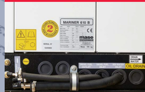
INPUT/OUTPUT FUEL PIPE

the engine is cooled by a coolant loop in a closed circuit. The system consists of a heat exchanger, inside which the heat exchange between coolant and sea water takes place. Two separate pumps provide for the circulation of coolant and seawater. Air flows ensure effective cooling of the alternator. The excellent accessibility makes maintenance operations easier, even with the generator installed in confined environments.